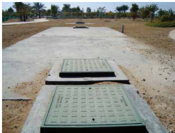
GRP Manhole cover Class C 250 - BS EN124