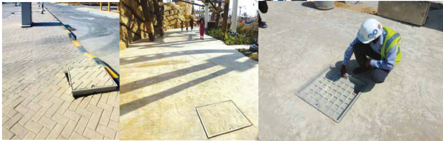
GRP manhole cover Class C 250 - BS EN 124